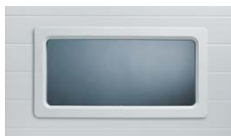
24" X 12" INSULATED GLASS