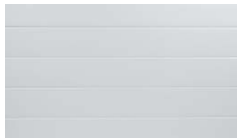
RIBBED PANEL WITH STUCCO EMBOSMENT