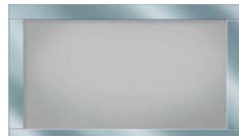
OPTIONAL FULL-VIEW PANEL