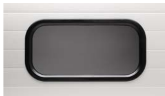
26" x 13" DOUBLE INSULATED ACRYLIC WINDOWS WITH BLACK FRAME WHITE FRAME AVAILABLE (SPECIAL ORDER)