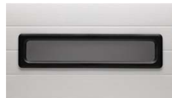
24" x 6" DOUBLE INSULATED ACRYLIC WINDOWS WITH BLACK FRAME WHITE FRAME AVAILABLE (SPECIAL ORDER)